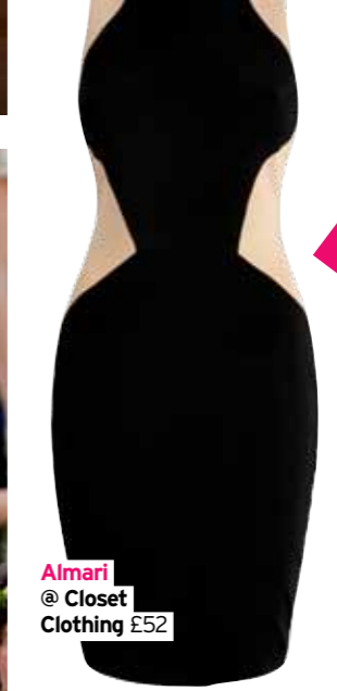
Almari @ Closet Clothing £52