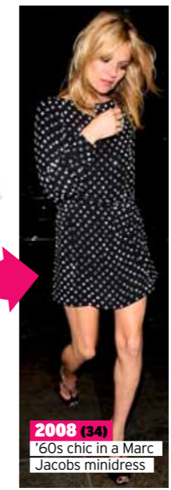
2008 (34) '60s chic in a Marc Jacobs minidress