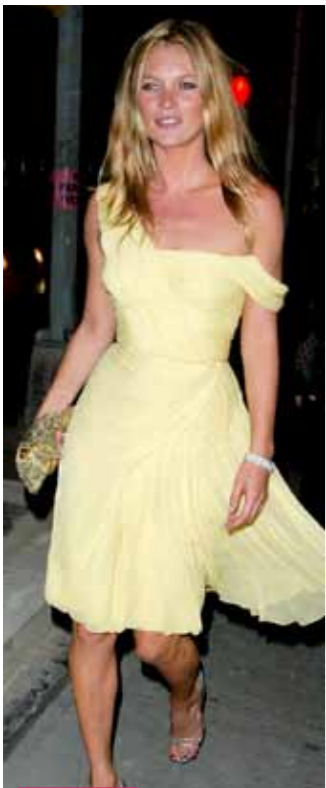
2003 (29) So pretty in a vintage lemon gown