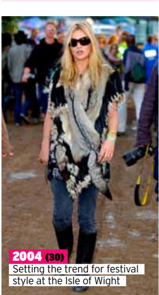
2004 (30) Setting the trend for festival style at the Isle of Wight