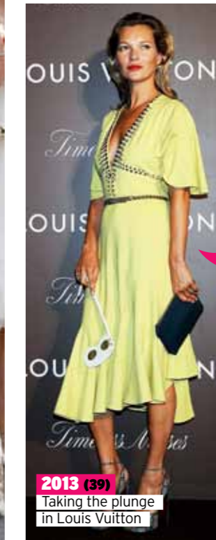
2013 (39) Taking the plunge in Louis Vuitton