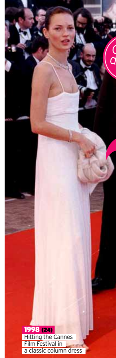
1998 (24) Hitting the Cannes Film Festival in a classic column dress