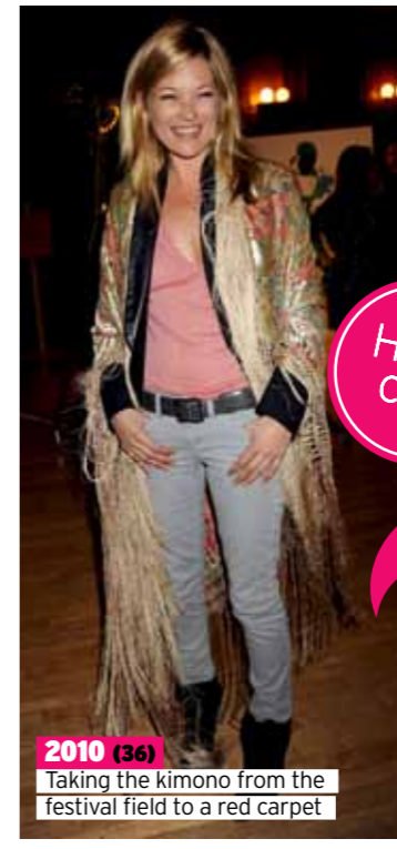
2010 (36) Taking the kimono from the festival field to a red carpet