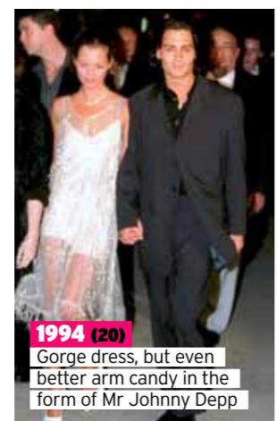
1994 (20) Gorge dress, but even better arm candy in the form of Mr Johnny Depp