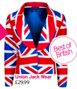
Best of British