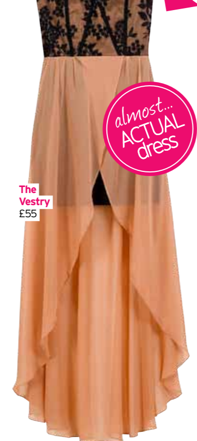
The Vestry £55