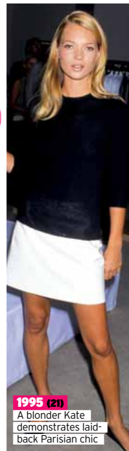
1995 (21) A blonder Kate demonstrates laid-back Parisian chic