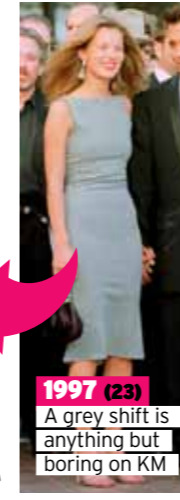
1997 (23) A grey shift is anything but boring on KM