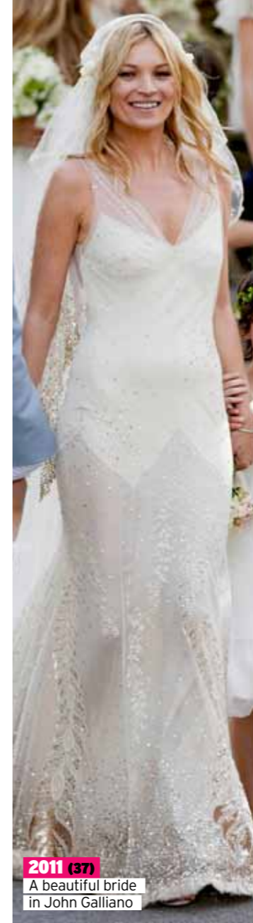
2011 (37) A beautiful bride in John Galliano