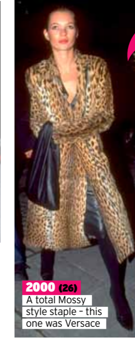
2000 (26) A total Mossy style staple - this one was Versace