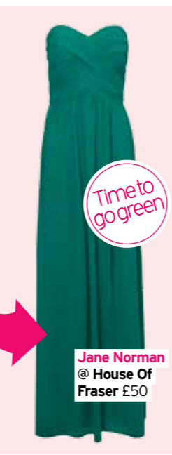
Jane Norman @ House Of Fraser £50