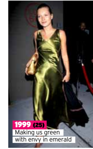
1999 (25) Making us green with envy in emerald