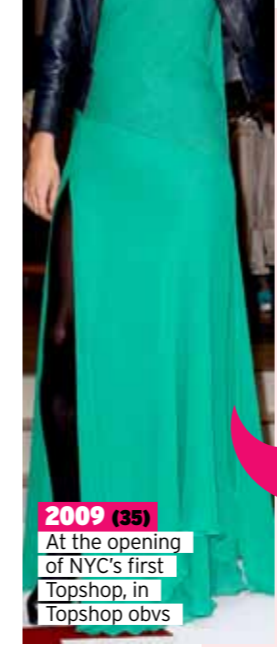
2009 (35) At the opening of NYC's first Topshop, in Topshop obvs