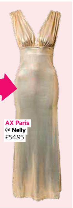
AX Paris @ Nelly £54.95